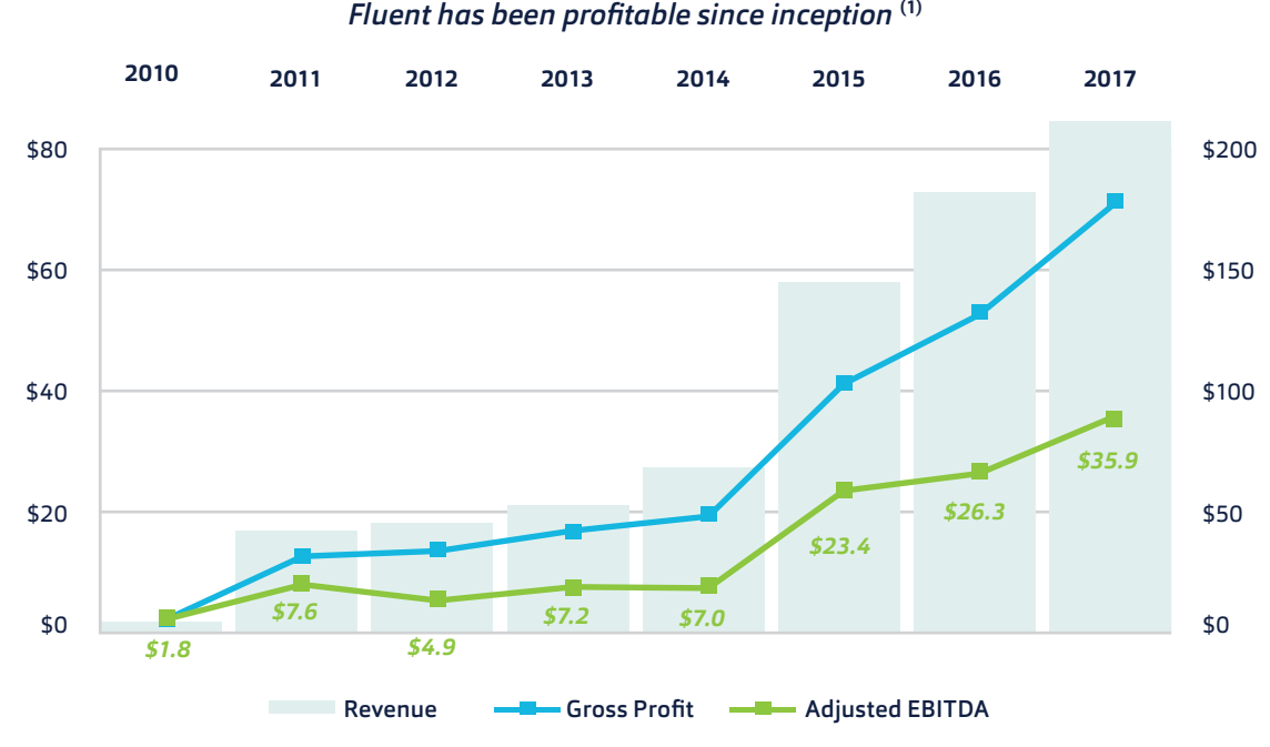
(1) Gross profit (as used herein) and adjusted EBITDA are "non-GAAP" financial measures, as defined under the U.S. Federal Securities laws. For additional information about these non-GAAP financial measures and a reconciliation of these measures, please see the Appendix included in the inside back cover to this Annual Report.

Fluent is growing, profitable, and has been since launching in 2010. The graph below shows our business performance since inception. These numbers are the best testament I can give to both the discipline with which we've always approached our model, and the adaptability that we've ingrained in our culture.